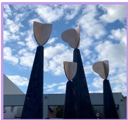
Photo 8. The sculpture 'Vigil – the Heart of Cabrini' in Australia.

Vigil – the Heart of Cabrini was installed at Cabrini Malvern in September and will be officially celebrated during Cabrini Week when we hold many ceremonies around the time of the Feast Day of St. Frances X. Cabrini.