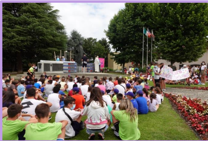
Photo 5. Children in Sant'Angelo Lodigiano on July 15.

On July 15th, our communication team had the opportunity to participate in celebrations for Mother Cabrini's birth in Sant'Angelo Lodigiano. On this occasion, the presence of our foundress and her legacy was tangibly felt, especially when all the people present embraced the statue of Mother Cabrini in Piazza XV Luglio.