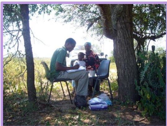
Photo 2. People in Eswatini serving the population.

The thesis identifies love as the foundational element of the Ignatian tradition. Love is likened to the taproot of the tree, with all other roots branching from this main root. The