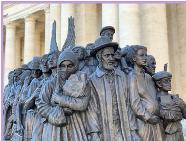
Photo 1. "Angel Unawares", the monument in St. Peter's Square dedicated to migrants and refugees.

It is our responsibility to keep it alive, active and true. We cannot, says the Pope, fail to speak of what we have seen and heard, in his message for World Mission Day 2021. (Cf. Acts 4:20). With Jesus and with our Mother, we have seen and proven that things can be different. Perhaps, we are as we were in the early days of the apostles and in the beginnings of the Institute: the Apostles were few; the Sisters were few. But the Church is still standing, the Institute is still alive and widespread. Let us be courageous. How many times does our Mother repeat to the Sisters: “Courage, Courage, my daughters”? Infinite times! May it be her voice that, like the wind in the sails of evangelization, takes us where the Lord of the harvest wants us to sow, and if necessary, even to the point of donating our lives.