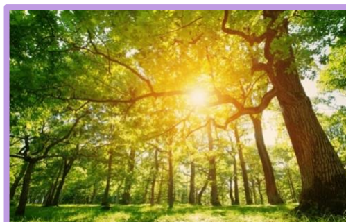
Photo 3. A beautiful tree in a sunny forest

Magis requires discernment, which is described in the thesis as an ongoing dynamic that permeates all activity, fostering our capacity to be free and available to live our Purpose . It involves making an honest appraisal of reality, reading the signs of the times and undertaking a rigorous analysis of the situation. Again, there are clear echos here of our Cabrini heritage and tradition.